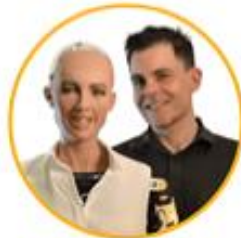
David Hanson, PhD. & Sophia

Former President Federal Reserve Bank of St. Louis